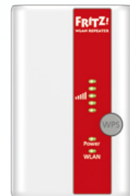
› FRITZ!WLAN Repeater 310