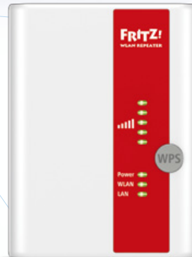
› FRITZ!WLAN Repeater 300E